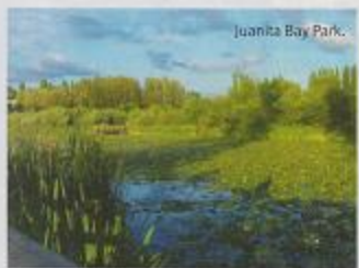
Juanita Bay Park.

You can soak up the festival vibe* July 16–18 (5 p.m.–10 p.m. Friday, 1 p.m.–10 p.m. Saturday, and 1 p.m.–6 p.m. Sunday), or pursue other entertainment options. Guests at the Woodmark Hotel can take a cruise on Lake Washington aboard a 1956 Chris Craft ($10, reservations required), see a $5 outdoor movie at Carillon Point or catch a show at the Kirkland Performance Center.