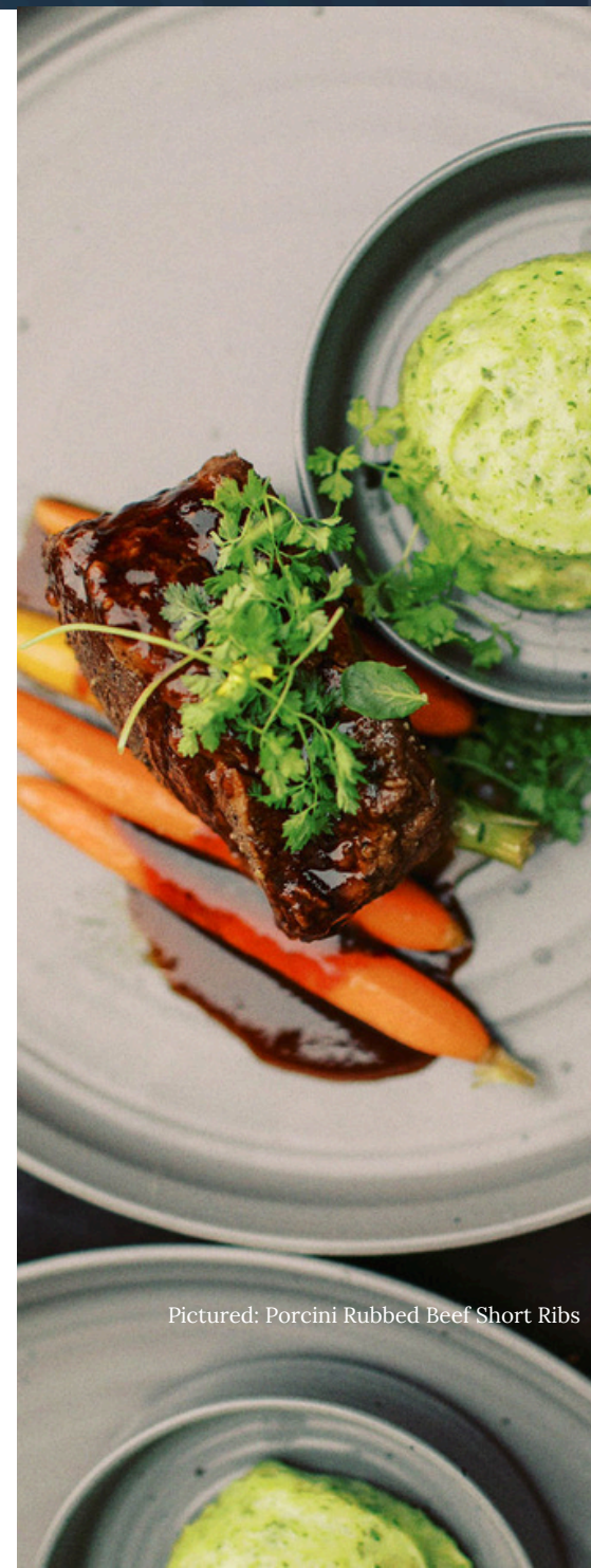
Pictured: Porcini Rubbed Beef Short Ribs

Balsamic Chicken, Foraged Mushrooms, Bacon GF