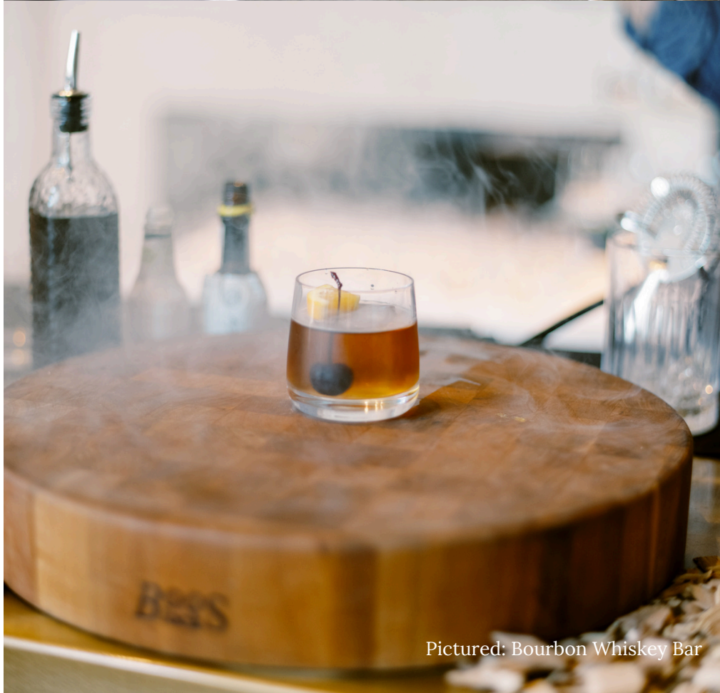
Pictured: Bourbon Whiskey Bar