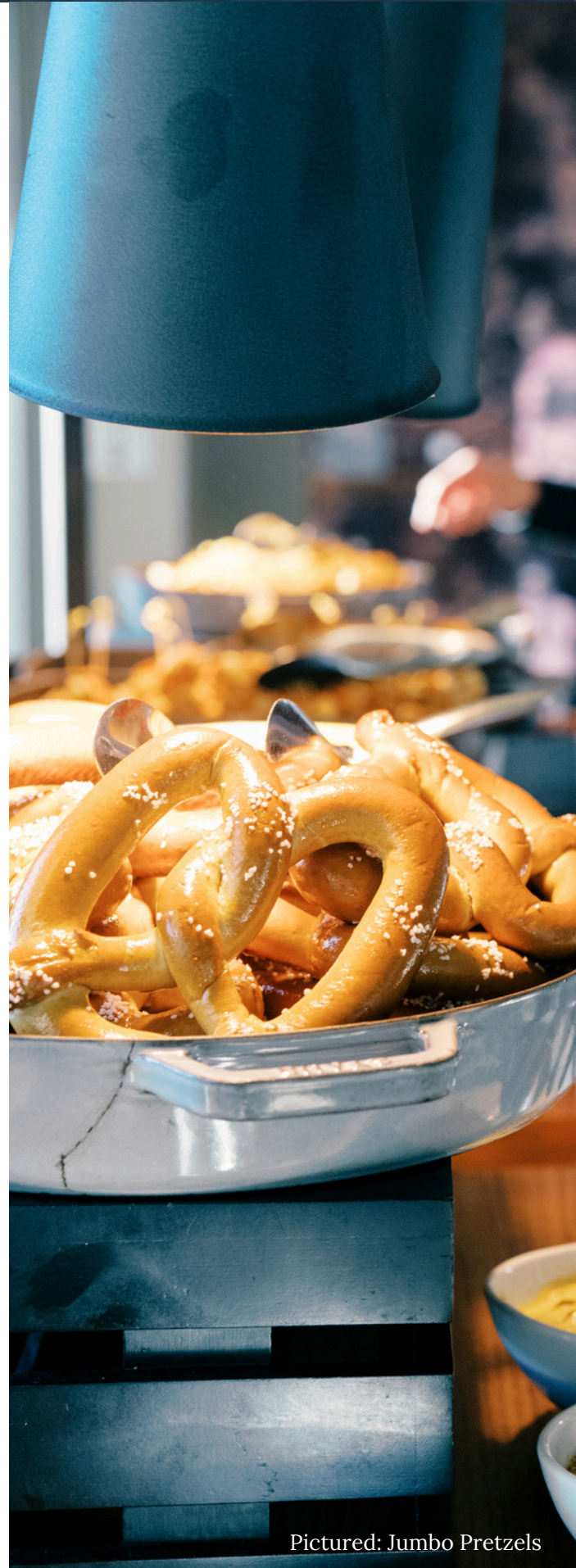
Pictured: Jumbo Pretzels

Dietary Identification: (GF) - Gluten Free, (DF) - Dairy Free, (Vg) - Vegetarian, (V) - Vegan