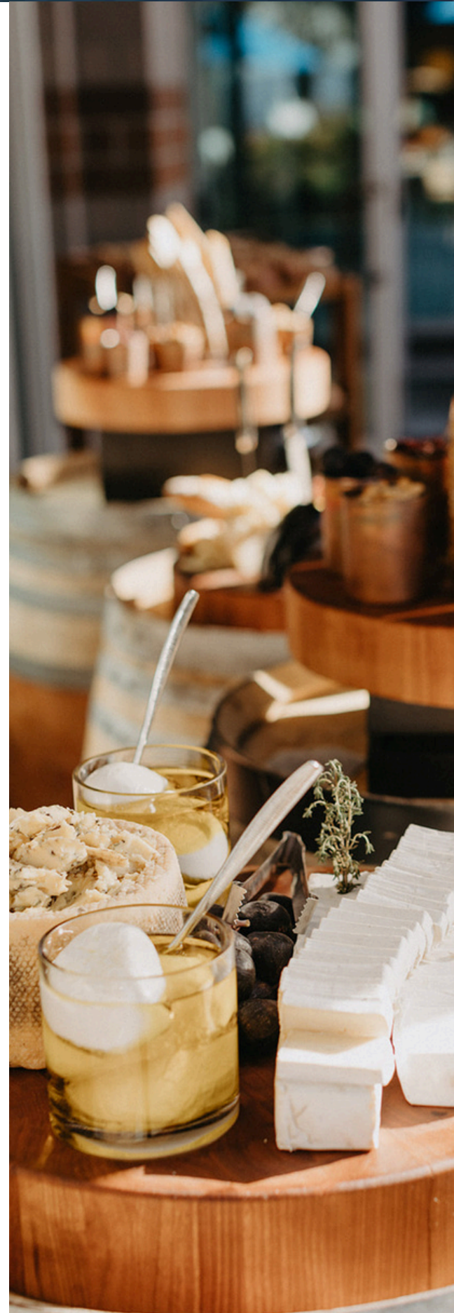
Pictured: Mozzarella Station

(Inquire about ice-carving, additional fee)