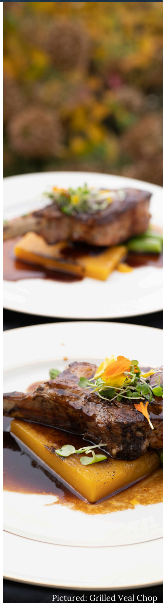
Pictured: Grilled Veal Chop

Dietary Identification: (GF) - Gluten Free, (DF) - Dairy Free, (Vg) - Vegetarian, (V)- Vegan